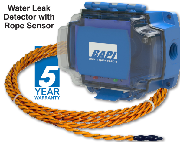
Water Leak Detector with Rope Sensor

Upon water detection, the alarm output relays change state, and a local red LED illuminates. The sensor detects dirty and purified water, deionized water, distilled water and reverse osmosis (RO) water.