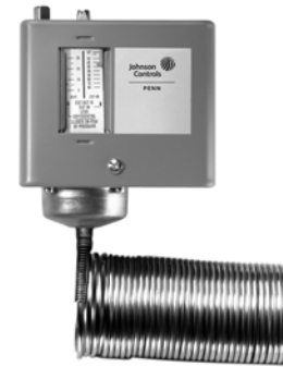
A70GA-1 Temperature Control