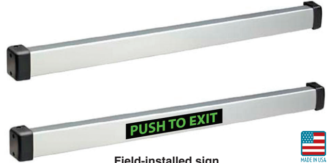
Field-installed sign 1"H green letters