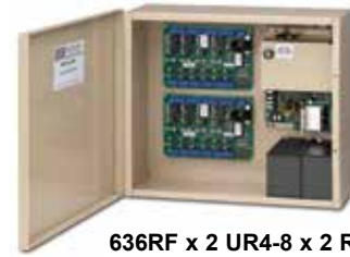
636RF x 2 UR4-8 x 2 RB12V7