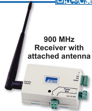
900 MHz Receiver with attached antenna