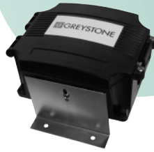
WD-100 - Water Detector Standalone