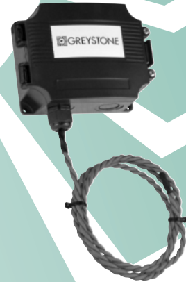
WD-100-XX - Water Detector c/w Conductivity Cable