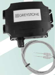
WD-102 - Water Detector c/w Remote Sensor