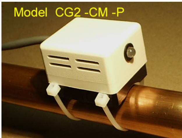
Model CG2 -CM -P (Pipe Mounted)

The CONSENSOR is generally accepted as the standard in the HVAC industry.