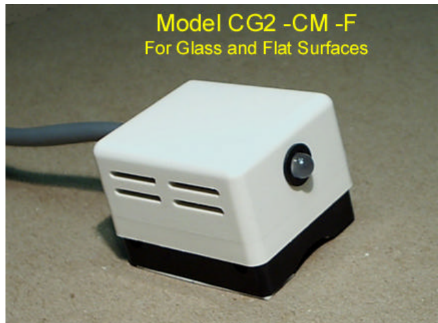
Model CG2 -CM -F (Flat Surfaces / Glass)

These integrate a Model CG2 CONSENSOR with a Model ICM Circuit Module. They provide fully isolated (Voltage Free) Normally Closed solid state contacts for systems with -- or without, a Controller. They can also be used in systems where valves, etc. are controlled directly by thermostats / relays, etc. The contacts open when the onset of condensation is sensed and close again when the threat passes.