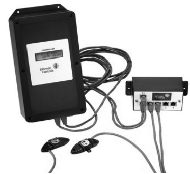
RA-1250 Thermal Dispersion Fan Inlet Sensor Airflow Measuring System

Sensors shall terminate at a router containing a multiplexer circuit. Multiplexer shall include a microprocessor that collects data from each PCB and digitally communicates the average airflow and temperature of sensing point to the microprocessor-based electronic controller. Multiplexer board shall be completely encased in electrical potting material to prevent moisture damage.