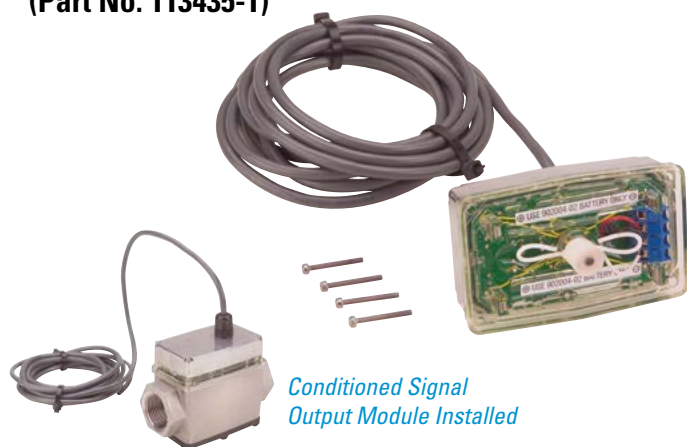
Conditioned Signal Output Module Installed

This module provides an unscaled, amplified, digital signal capable of transmission up to 5,000 ft. (1.5 km). There is no need for additional signal conditioning or amplification devices to achieve the desired digital signal. Use on G2 "Turbine Only" model.