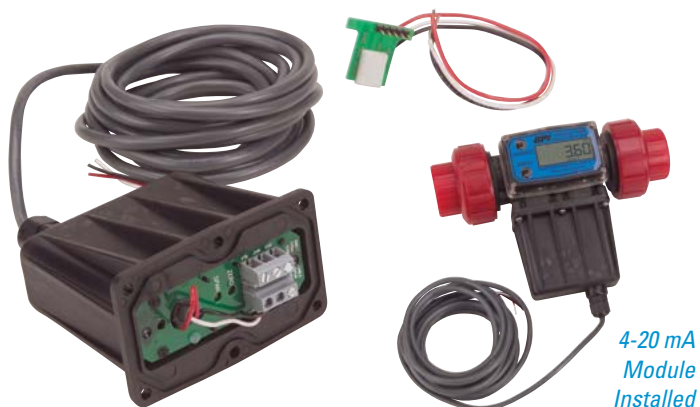
4-20 mA Module Installed

Combine the 4-20 mA Module with an Industrial Grade Turbine and Computer Electronics to provide an industry standard analog signal for connection to a wide variety of chart recorders, display equipment and process control equipment.